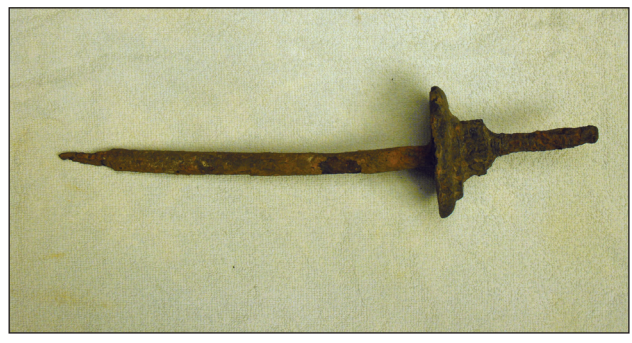
Figure 9: Corroded timber crib connection steel pin.