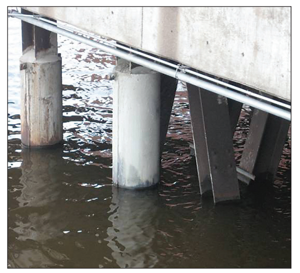
Figure 13: Steel jacket option shown on steel pile.