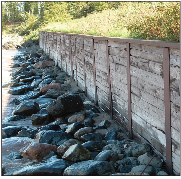
Figure 3: Timber soldier pile wall.