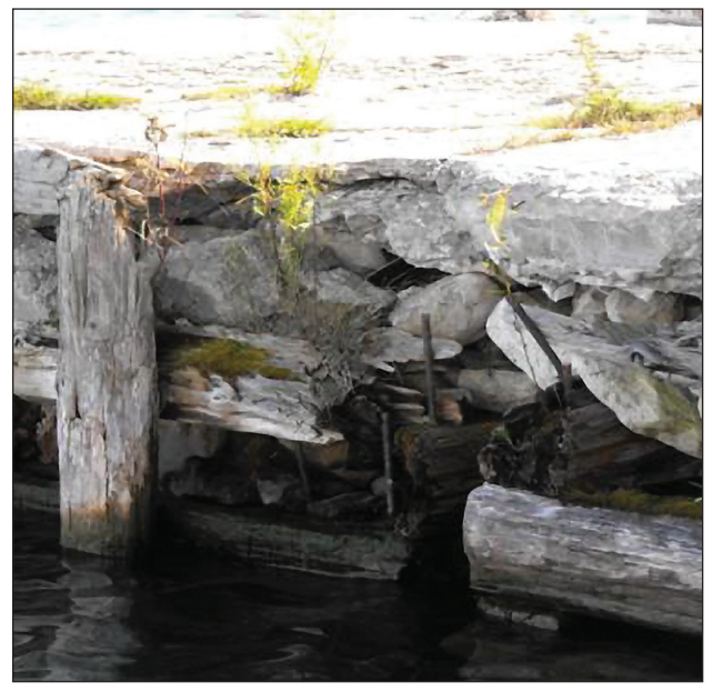
Figure 4: Timber structure rot (Gene Clark/UW Sea Grant Institute).