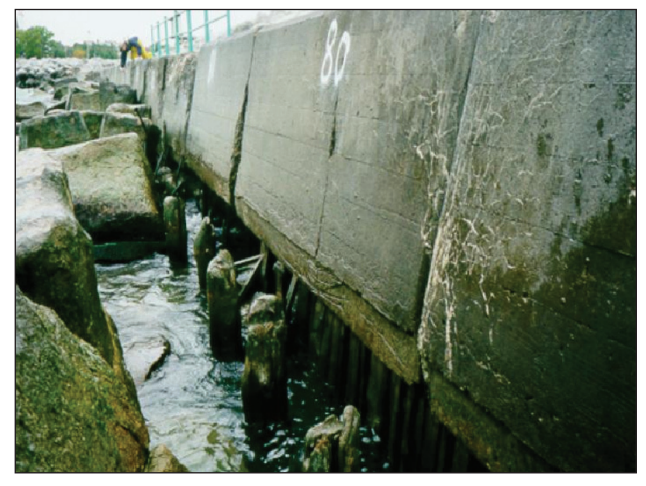
Figure 5: Timber piling rotting at the water surface (Larry Ryan–Baird).

Timber wear or abrasion due to ice or ship damage are other common conditions that can lead to timber failure. While this type of failure does not often compromise the structure behind the timber, it can cause significant damage to the vessel attempting to moor alongside the vertical face of the structure. Figure 8 shows abrasion damage to a timber abrasion protection section.