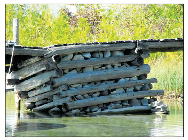
Figure 7: Timber crib settlement failure.

Sea Grant fact sheet "Accelerated Freshwater Harbor Corrosion," which is available in the Aquatic Sciences online publication store at http://aqua.wisc.edu/publications/PDFs/FreshwaterHarborCorrosion.pdf.) Once these steel pins corrode, the timber cribs start to come apart and fail similarly to those with rot issues. Figure 9 shows a corroded steel pin. Note that steel remains where the pin would be in the timber, but it is corroded where the pin would exit the crib and cross the open stone-filled interior of the crib.