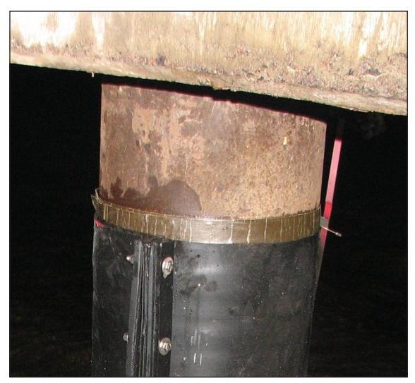
Figure 15: High-density polyethylene jacket option shown on steel pile