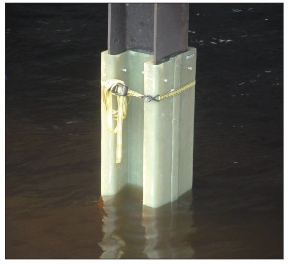
Figure 14: Fiberglass jacket option shown on steel H-pile.