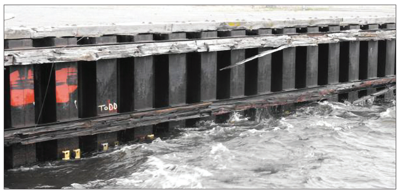
Figure 8: Timber ice abrasion damage.