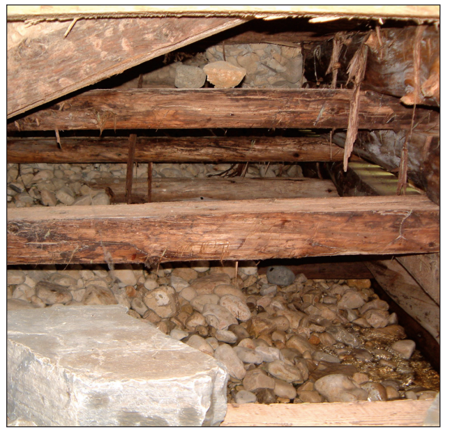
Figure 6: Timber crib with interior rock loss.

Another reason more timber crib structures have failed recently is that the steel pins used to connect them have been corroding. (For more information, refer to the Wisconsin