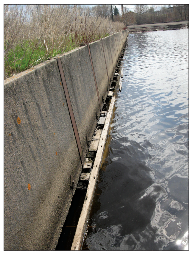
Figure 10: New wall constructed on top of failed timber crib (Chad Scott–AMI Consulting Engineers).

When the timber deterioration is near the water surface, the failed timber can be removed and a new structure attached to the remaining crib top near the water level. This structure could be a new timber crib or steel H-beams attached to the existing crib, with either new timber beams or precast concrete panels placed between the vertical beams (soldier pile walls). See Figure 10 for an example of a new concrete wall constructed on top of a failed timber crib.