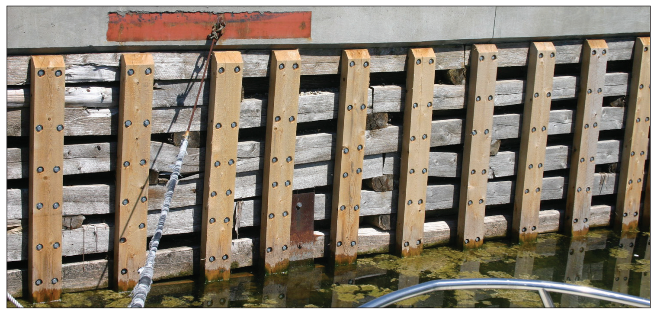
Figure 11: A failed timber reinforcement section (Larry Ryan-Baird).