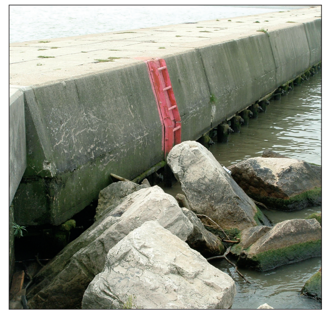
Figure 1: A typical U.S. Army Corps of Engineers breakwater section (Gene Clark/UW Sea Grant Institute).